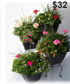
14.5" Geranium Combo Pink, Red & Salmon