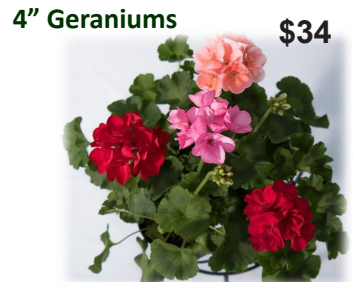
4" Geranium Case of 8 Pink, Red & Salmon

NOW, MORE THAN EVER, WE NEED YOUR SUPPORT.