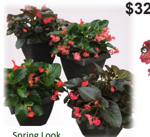
14" Whopper Begonia Assorted Only