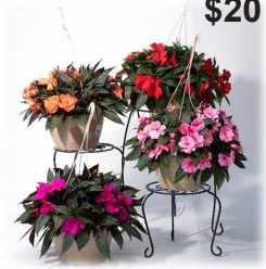
New Guinea Impatiens Orange, Red, Purple & Pink