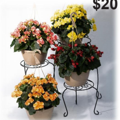
Rieger Begonia Pink, Yellow, Orange & Red