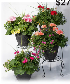
12" Geranium Combo Pink, Red & Salmon