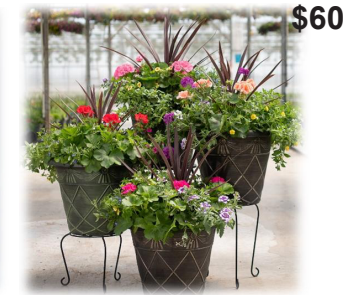
18.5" Geranium Combo Pink, Red & Salmon