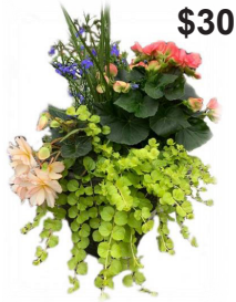
12" Begonia Shade Combo - Assorted