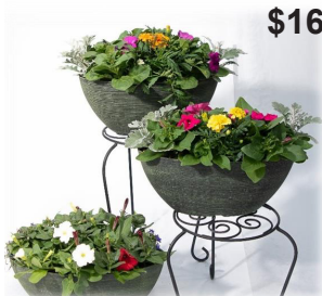
15" Annual Combo Oval Assorted