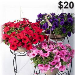
Wave Petunia Assorted