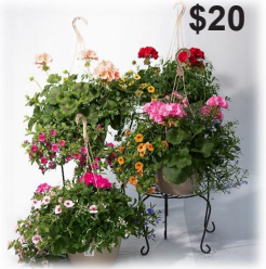
Geranium Combo Pink, Red & Salmon