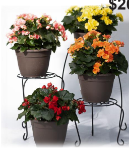
10" Rieger Begonia Pink, Yellow, Orange & Red