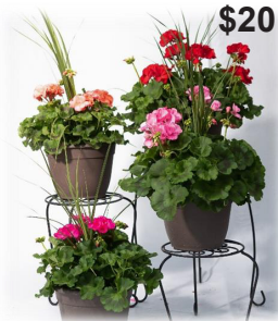
10" Geranium w/Spike Pink, Red & Salmon