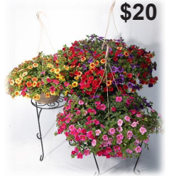
Million Bells Assorted